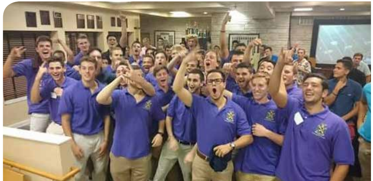
FL Delta's Fall 2015 New Member class celebrate on bid day

FL Delta continues to aim higher, striving to repeat its win at Nose Bowl by score, achieve the highest fraternal GPA on campus, and beat its past year's fundraising goals for Dance Marathon. Capitalizing on the unique opportunity afforded to them just over a year ago while keeping in mind our Creed and values, the brothers of Pi Lambda Phi Fraternity at the University of Florida are truly embodying what it means to Lead like a Pilam for "Not Four Years, But a Lifetime".