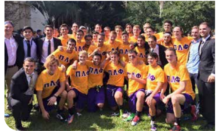
FL Delta (University of Florida) - 2016 Nose Bowl Champions