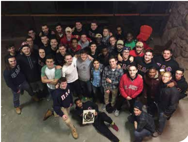
NY Beta Omicron Fall at St. John's University celebrates after the initiation of their Fall 2016 new member class