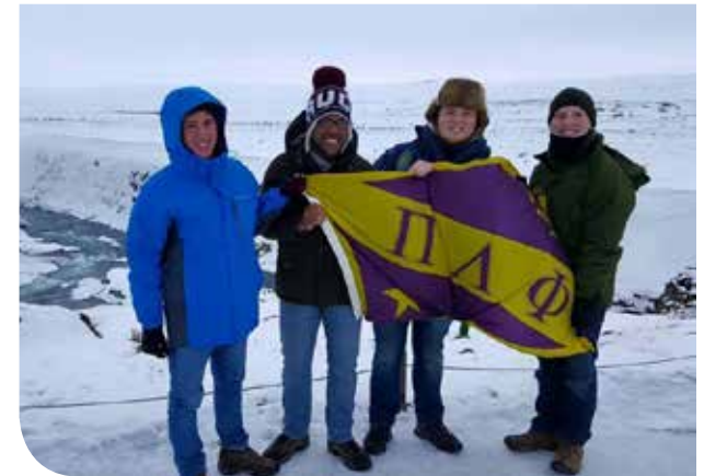
VA Alpha Psi (Christopher Newport University) Brothers in Iceland