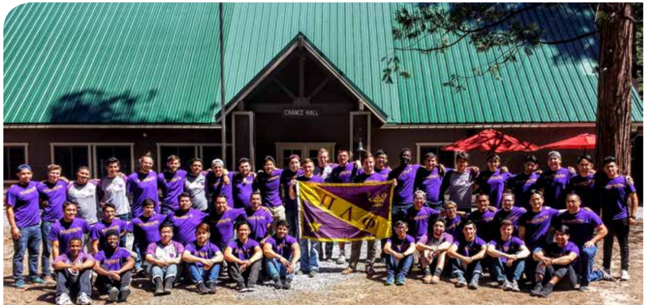
CA Alpha Upsilon (University of California, Merced) Founding Class, Spring 2016

We continue to have some of our strongest years ever in respect to financial collections. Attendance at both regional conferences and our summer Convention continue to increase every year. Our overall membership numbers