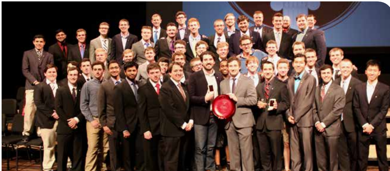
IN Alpha Theta (Indiana University) receiving IFC Chapter of Excellence Award, Spring 2016