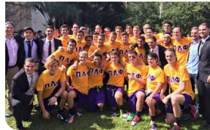
FL Delta (University of Florida) - 2016 Nose Bowl Champions