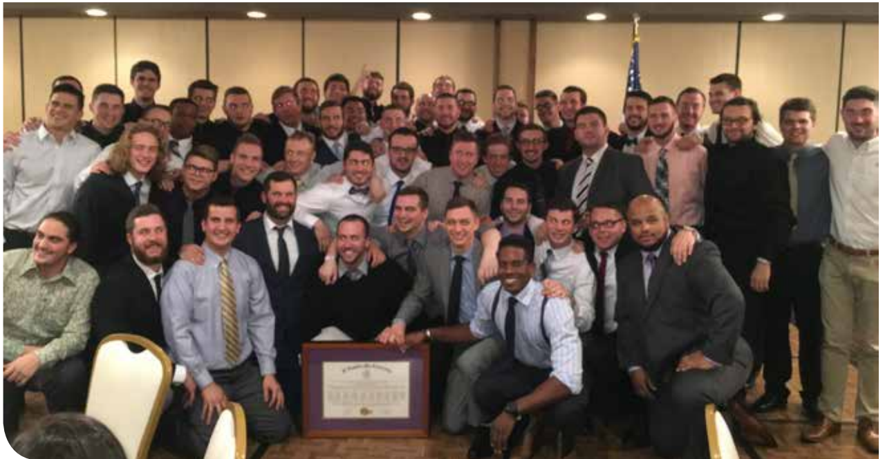
Brothers of the PA Alpha Gamma Chapter at Bloomsburg University celebrate receiving their charter on November 12, 2016.