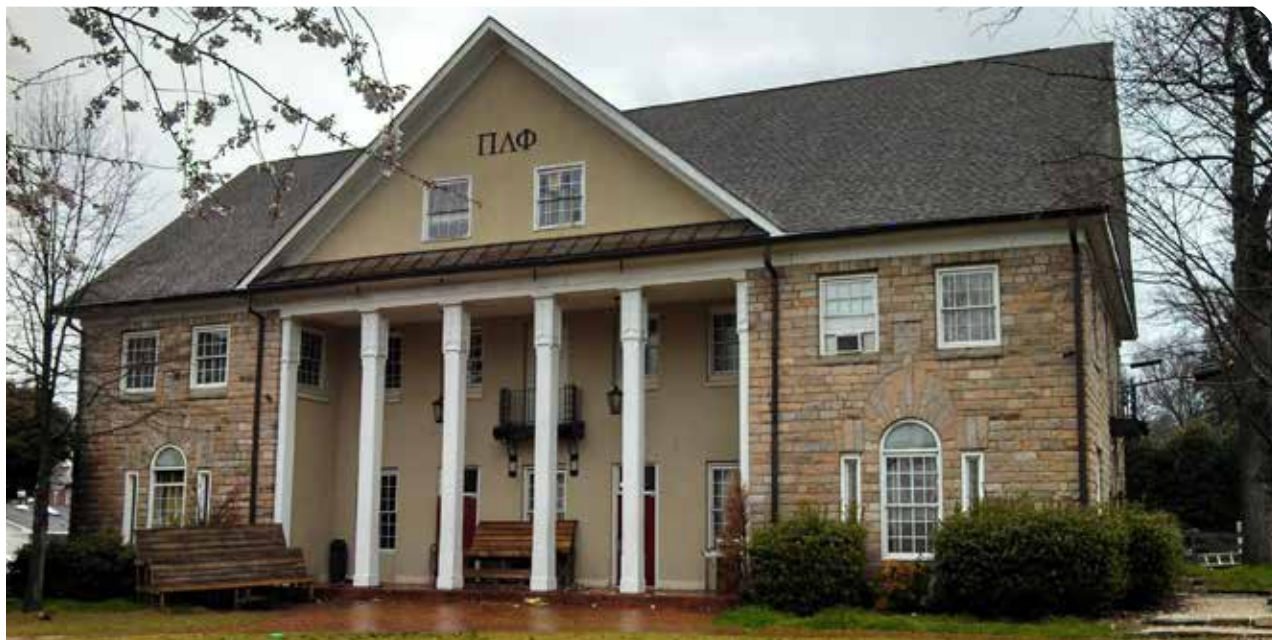
The NC Omega Beta Chapter House at the University of North Carolina at Chapel Hill