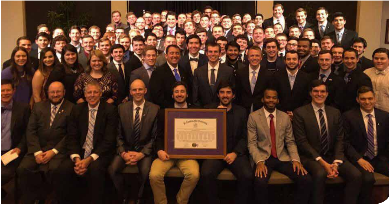
Brothers of the IN Alpha Theta Chapter at Indiana University and special guests celebrate re-chartering of the Chapter on November 13, 2016.

Alpha Theta holds the record for achieving the fastest charter from a re-founded colony.