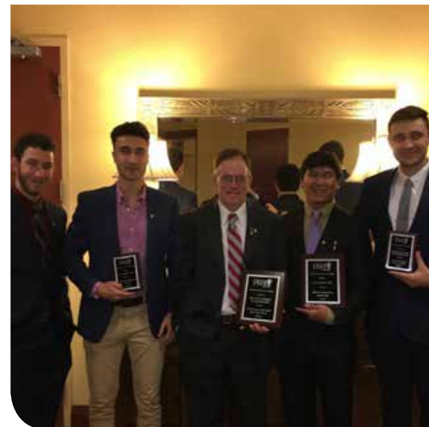
FL Delta Upsilon Brothers receive multiple University awards in Fall of 2016, including the Most Improved Chapter

No submission received at the time of publication.