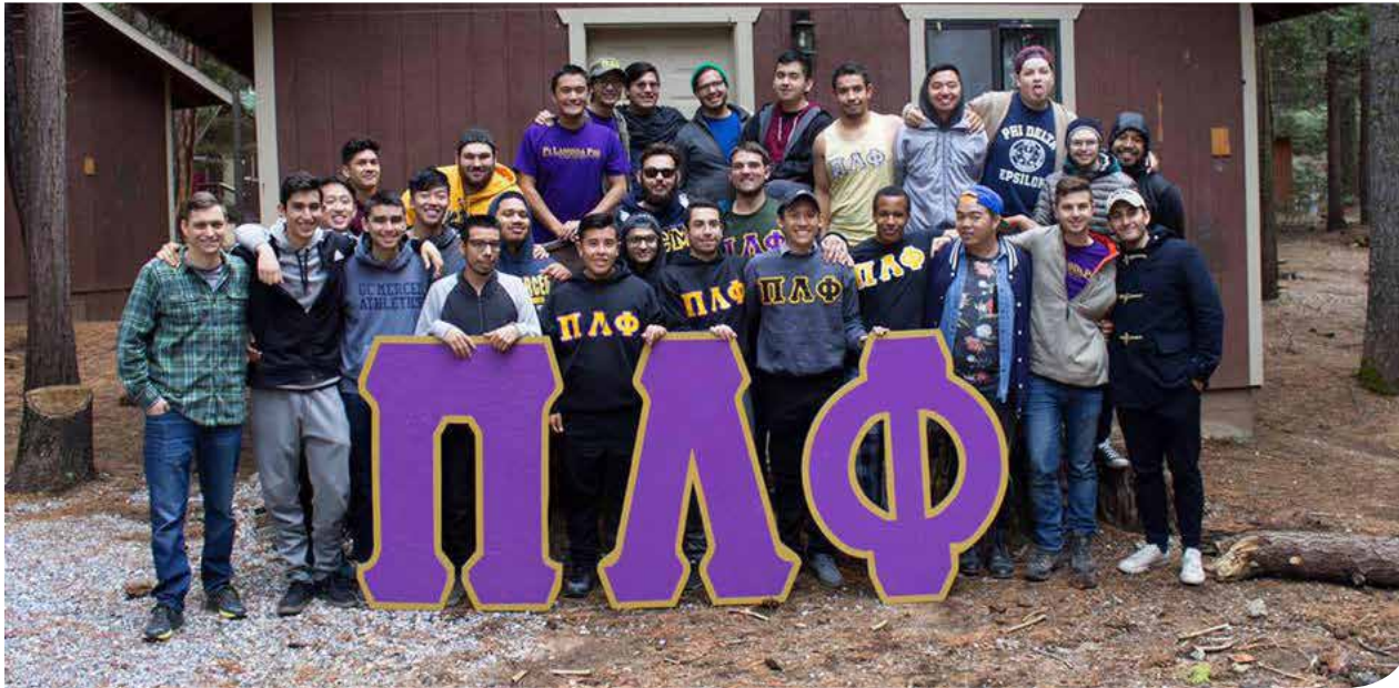
CA Alpha Upsilon at the University of California, Merced welcome their newest brothers in Fall of 2016.